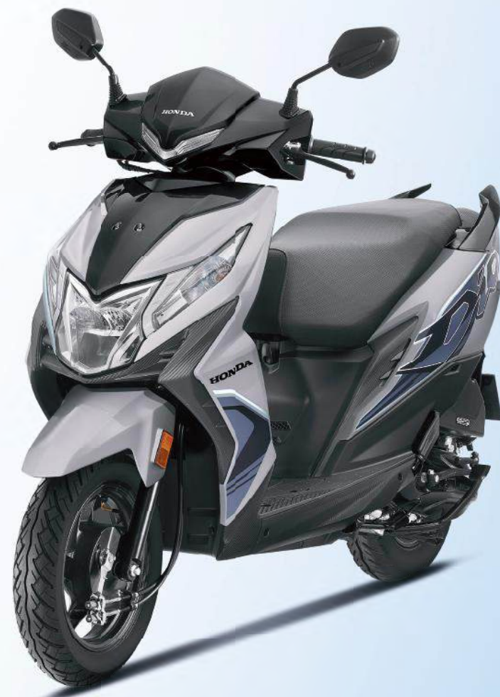
PEARL IGNEOUS BLACK + PEARL DEEP GROUND GRAY